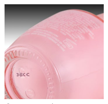
Cosmetics - glass