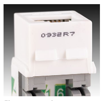
Electronics - plastic