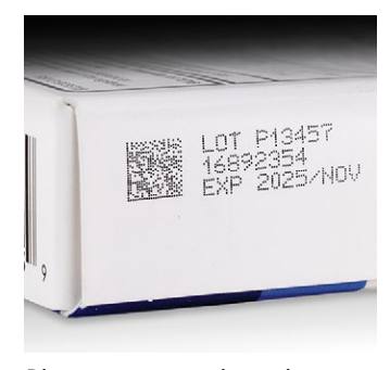
Pharma – paperboard

* Subject to availability in your country