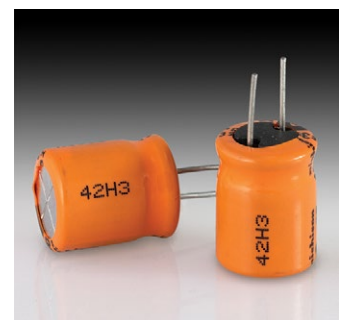
Electronic components – plastic